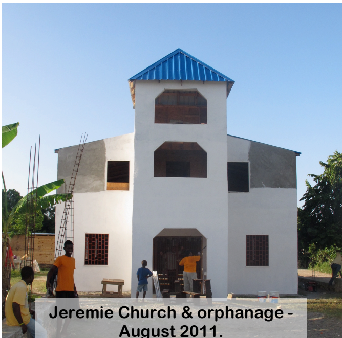
Jeremie Church & orphanage - August 2011.

Don't know how far this letter will go - but if God touches your heart about this church and the orphans who also lived there, please let me know. Maybe you were there and would like to help again. Forward this email to others who may have been in Jeremie as well. Possibly we can raise funds and send some teams back to help them rebuild !?! If any of this touches you, please send me an email and I will follow up with you. Thanks and God bless !!