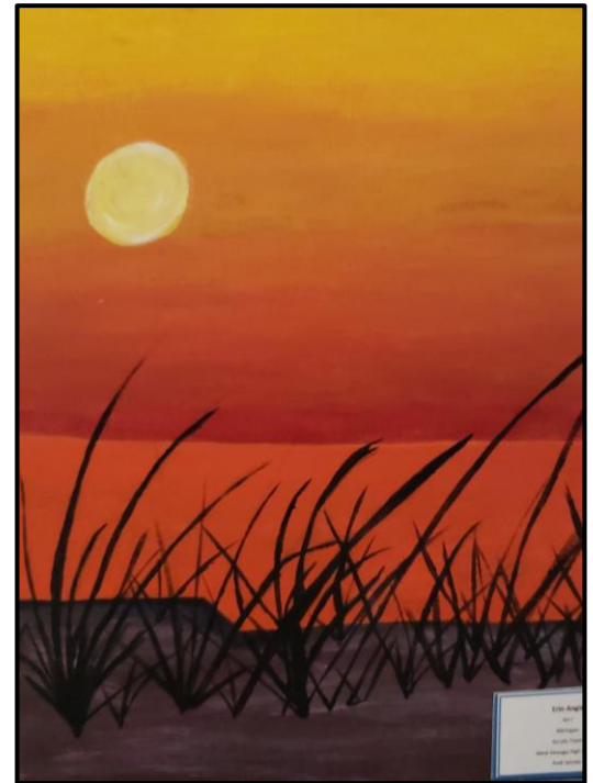
"Michigan Sunset" by Erin Angle