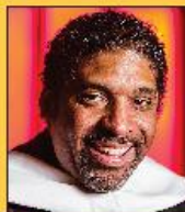
Wednesday morning Rev. Dr. William J. Barber, II, co-leader, Poor People's Campaign: A National Call for Moral Revival