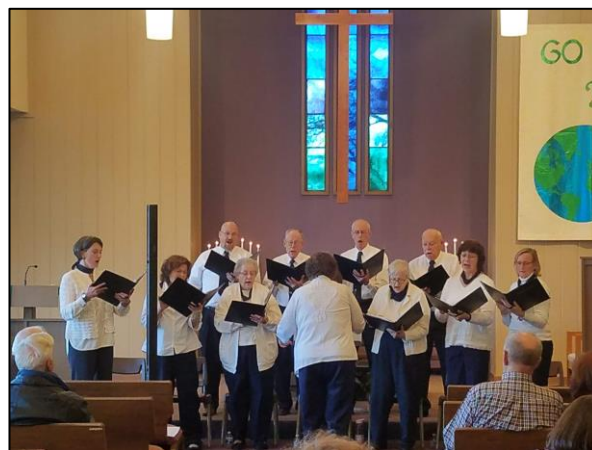
The Grateful Praise Choir