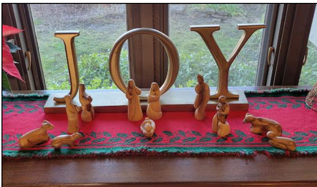
This beautiful olive wood Nativity scene came from Israel and is on display in the narthex.