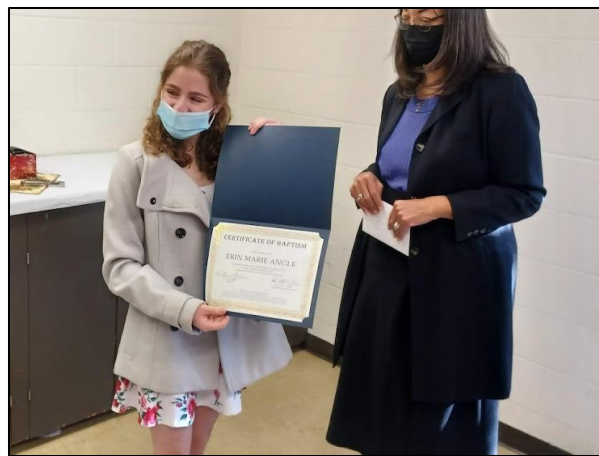
Family and friends were present for the joyous occasion and fellowship that followed.