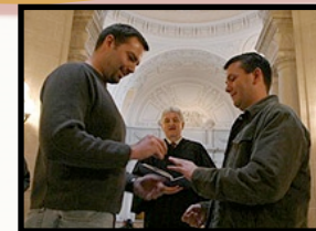
The changing of the laws is part of the agenda of the anti-Christian movement.

(Dan 8:25) predicts this new world leader will CHANGE the times and the laws. It is said, he has no desire for women (Dan 11:37) and Jerusalem which means "Peace" has its spiritual name changed to Sodom (known for homosexual citizens) when this leader sets up his capital there (Rev 11:8). Currently, a worldwide initiative through the United Nations is under way to overturn the laws protecting traditional marriage, promote homosexuality in public schools, and to silence all speech opposing this lifestyle.