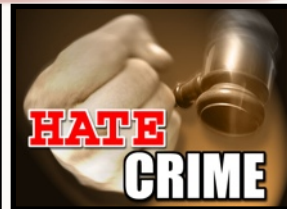
Our freedom of speech is being restricted when opposing views of homosexuality will not be tolerated.