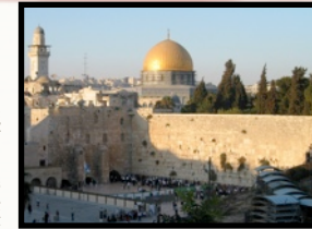
Jerusalem will be a stumbling block to the whole world - the world leader will make his capital here

(Dan 7:26) predicts that the above world leader will descend from the people who destroyed the Temple (70 A.D.). This act was accomplished by the Roman government. (Dan 2:42) states that the final Iron Kingdom (represents Rome) is a combination of hard and soft governments - dictatorships and democracies. They will unite together to build a world empire rooted in the former areas of Rome (Europe and the Mediterranean) and signs a peace treaty (Dan 9:27) with Israel* - became a nation in 1947