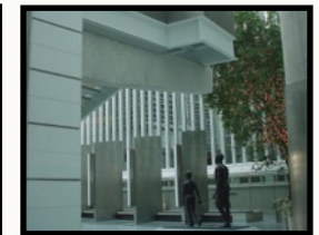
The pre determined goal of the centralized World Bank and the Bilderberg Club.