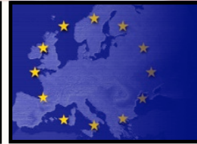
The European Union formed a unified front in 1956 as they signed the Treaty of Rome