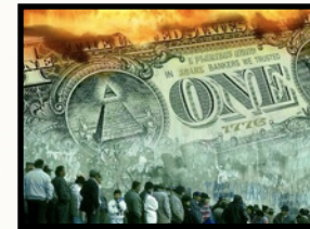
The collapse of the American Dollar will be the tipping point for globalization.

(Rev 13:16,17) predicts a world leader who will create a global economy that controls both the rich and the poor. This new economic structure will bring prosperity to the crumbling world financial markets and establish this new world leader as the ultimate problem solver (Dan 8:24, 25). There are numerous private and public organizations who are forming and developing plans to implement this system including the United States and her NATO allies along with the G8 richest nations.