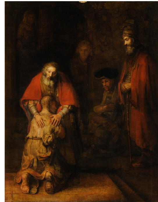
Rembrandt, The Return of the Prodigal Son, 1662-1669 (Hermitage Museum, St Petersburg)

Please visit our website @ www.rochesterlife.org