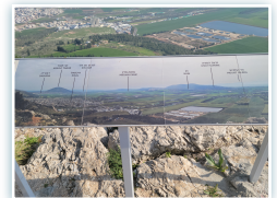
Nazareth, Megiddo Valley