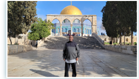
PROPHETIC WORD OVER THE TEMPLE MOUNT