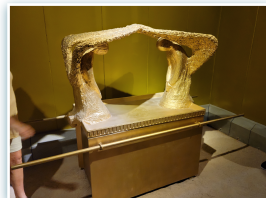
Ark of the Covenant