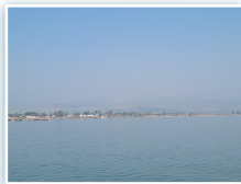
Sea of Galilee