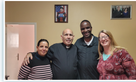
MINISTERING IN BETHLEHEM