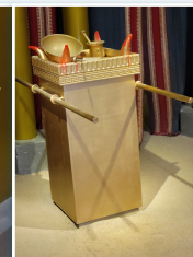
Altar of Incense