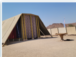
Replica of Tabernacle