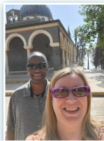
Mt. of Beatitudes