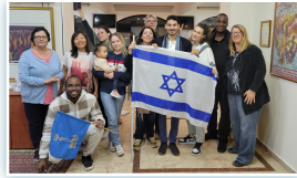
MINISTERING AT THE HOUSE OF PRAYER

NOW UNTO HIM THAT IS ABLE TO DO EXCEEDINGLY ABUNDANTLY ABOVE ALL THAT WE ASK OR THINK- EPH. 3:20