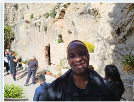
Garden Tomb-He is Risen!