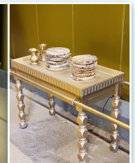
Table of Showbread