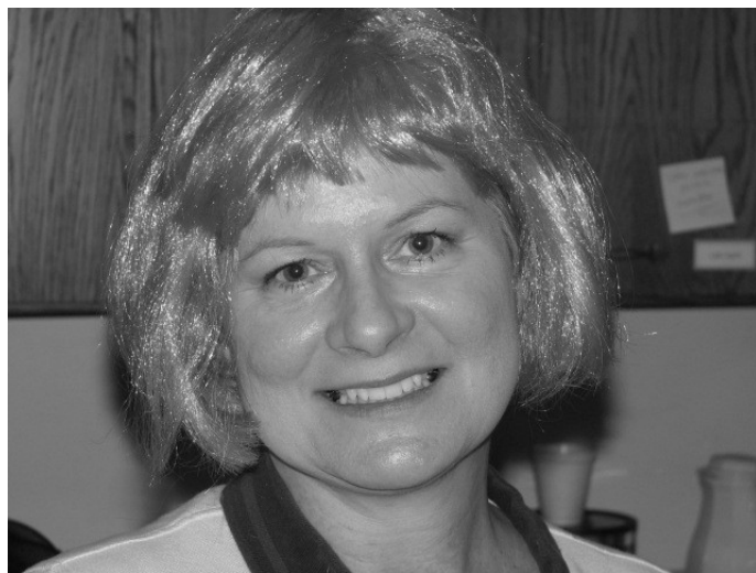
This photo was taken during Awana Crazy Hair Night