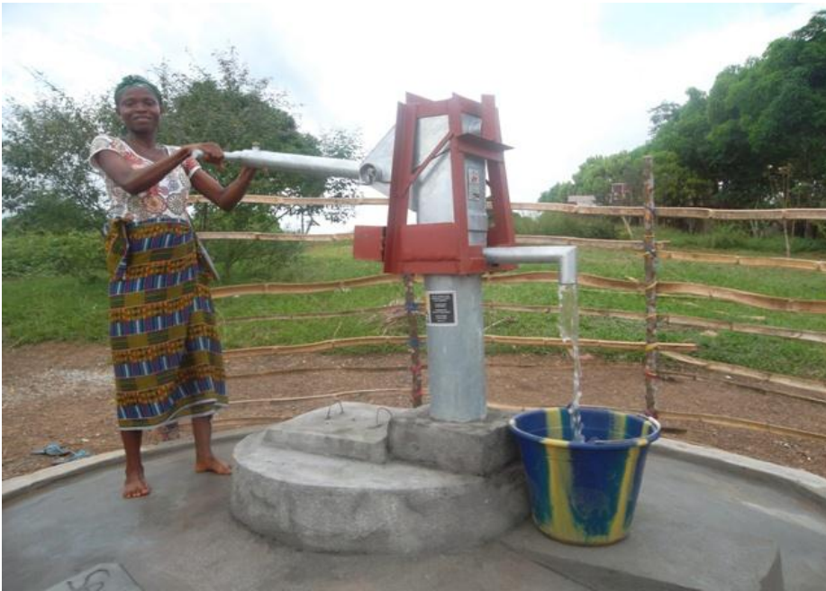
Community member pumping clean, safe drinking water from the new and reliable water source.