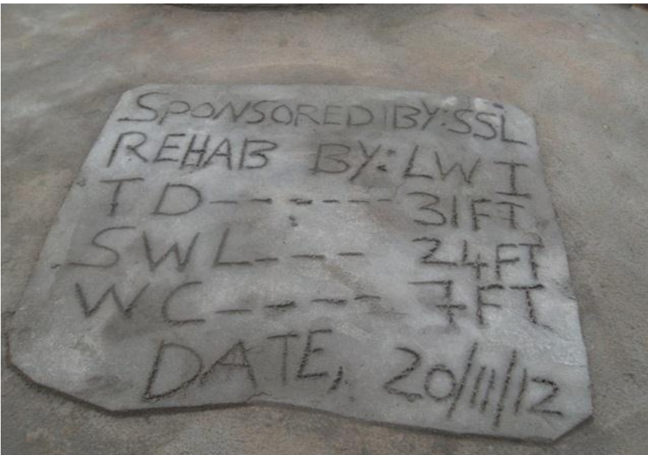
Close up of plaque.

Previous water source depended on by the entire community to meet all of their water needs. A LWI Liberia team member commented, "The town suffered from the problem of poor water quality from the previous water source. Which seriously affected the health of children as running stomach was rampant."