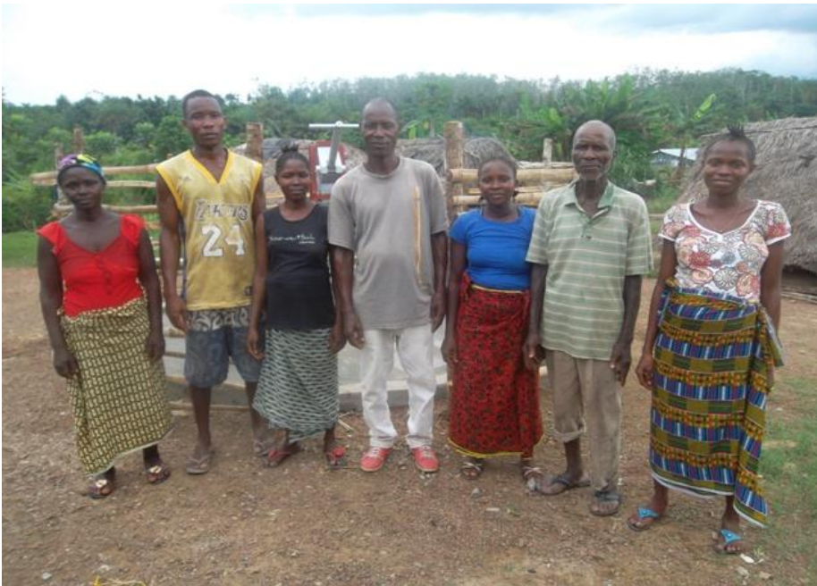
Water committee members who are responsible for helping maintain the well and who were provided with a LWI Liberia contact number in case their well were to fall into disrepair, become subject to vandalism or theft.