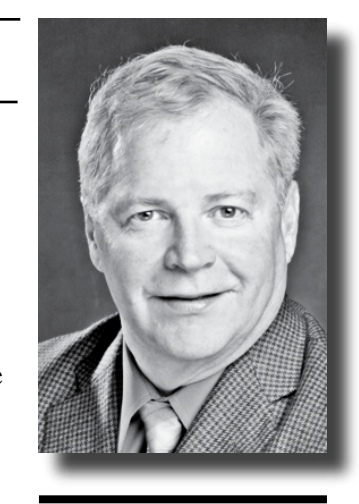
Letter from the Tresident

On the east side of the state, the City of Spokane is now beginning to deal with a projected $7 million shortfall in its budget.