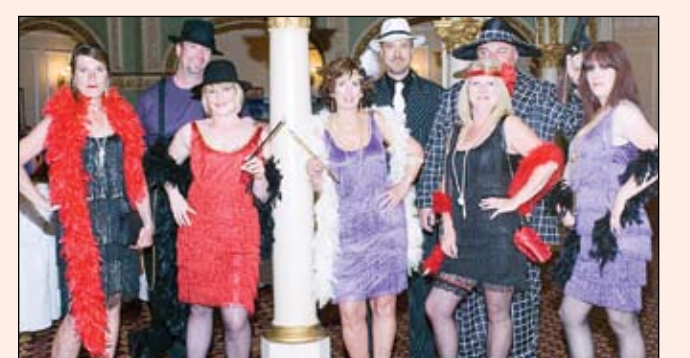
Host Committee getting ready for Saturday night's dinner-dance