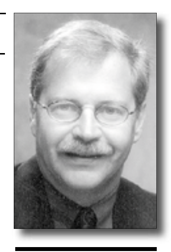
Letter from the Tresident

ur biennial Jui Die... convention is one of the most significant events on the Council 2 calendar. So much so that its ripple effects are felt through the organization long after the close of the activities. Even those who do not attend benefit indirectly from the convention's impact on our daily union activities.