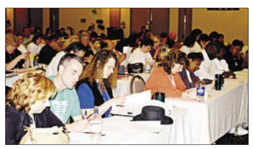
Convention delegates study a resolution before voting on it.