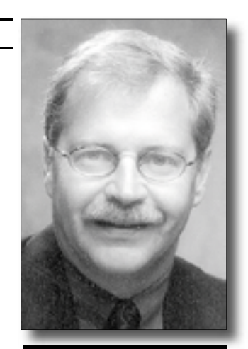
Letter from the Tresident

I sush, borrow and spend. I guess I'm the problem. As a member of the baby boom generation born after World War II we're the ones that have created the crisis in the Social Security system. According to the Bush Administration, we're the