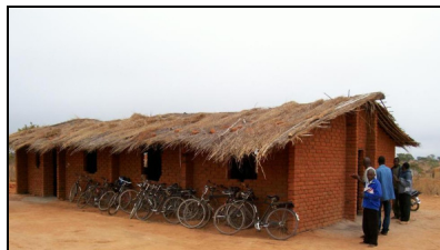
Church in Mozambique

We recently had the opportunity to minister in Mozambique during a weekend in September. Like many areas of Malawi, the spiritual climate is in need of the gospel of the Lord Jesus & the power of the Holy Spirit to drive away the darkness. We rejoice that some received the Lord Jesus and others were released from demonic oppression & possession. Witchcraft is still practiced so please continue to pray for the captives to be set free!