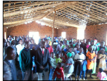
Sunday AM in Mozambique