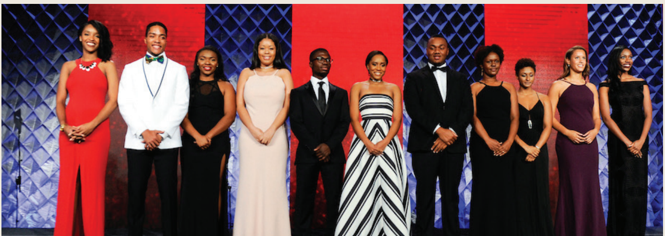
ELC Scholars recognized on stage at The ELC's Annual Recognition Gala in Washington, DC.

For more information, please contact The Executive Leadership Council at (703) 706-5200 or scholarships@elcinfo.com