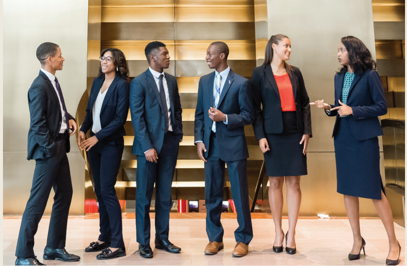
ELC Scholars prepare to meet with executives at HSBC Bank in New York City.

Scholars begin their week in New York City where they visit global companies and engage in one-on-one meetings with senior-level executives. The scholars will visit select cultural sites and attend evening receptions and/or dinners with ELC members and other senior executives. The scholars end their Symposium experience in Washington, D.C. where they attend The ELC's Annual Recognition Gala.