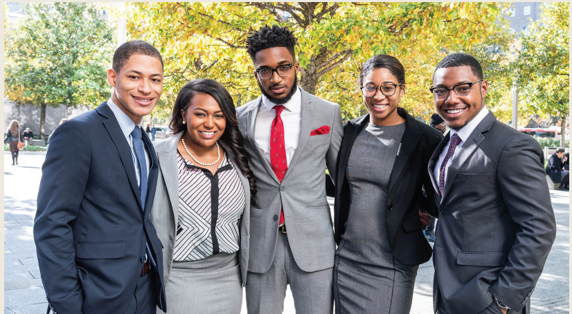
ELC Scholars visit the 9/11 Memorial & Museum in New York City.