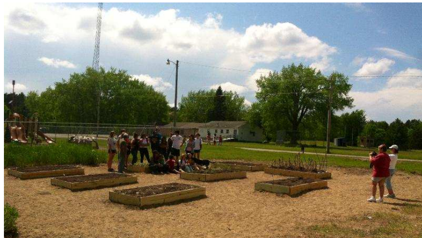
Pictured are participants in the 2013 Onigum Mission trip, standing among the eight raised garden beds that were built, filled with topsoil and planted last week, to create the St. John's Community Garden on a site that had been a field of weeds when we arrived.