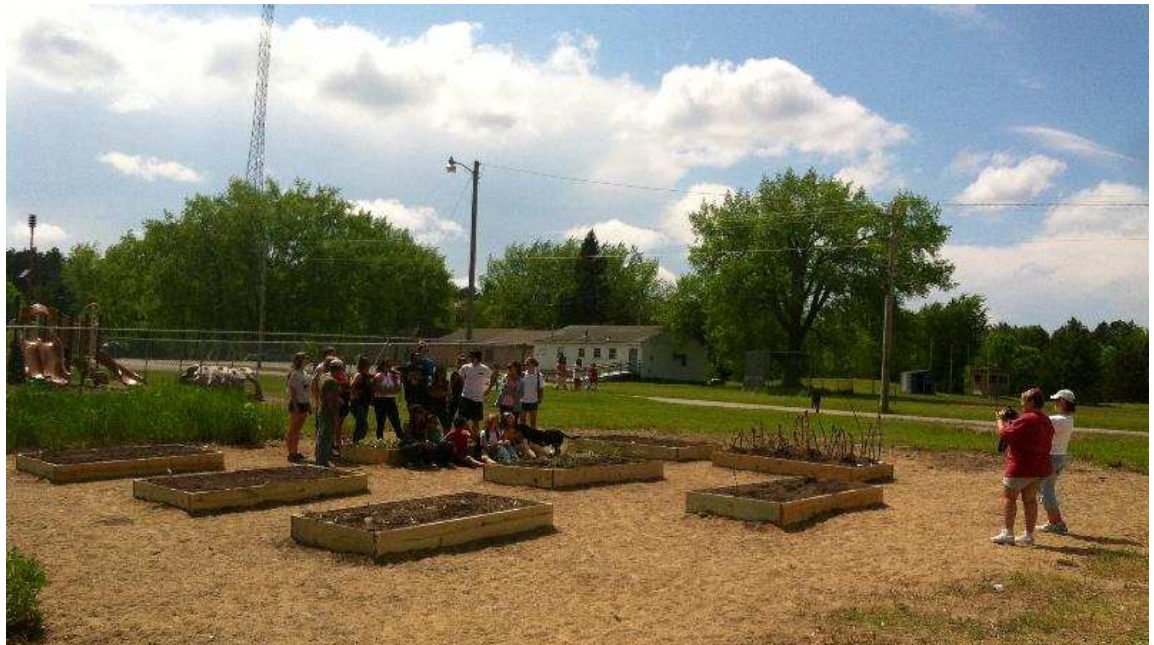
The Community Garden at St. John's

"The garden is blooming! I watered the beds almost a week and a half ago, but timely rains have done most of the nourishing. Weeding will begin this Thursday and Friday, as I've been holding off while waiting for the "row crops" to establish their roots. You have made a difference! A hearty "Miigweth" from us all :)"