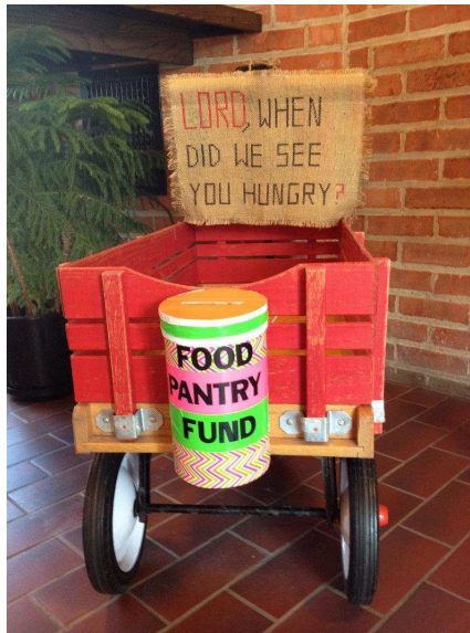
Little Red Wagon