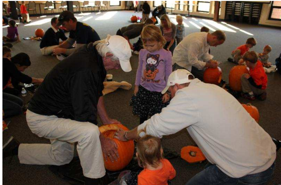
Three generations of the Newman Family carving Pumpkins!