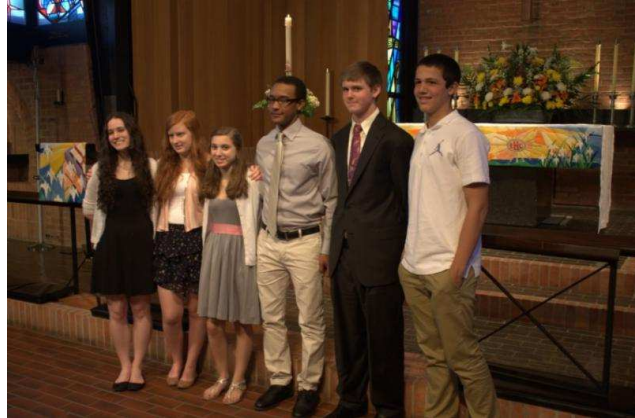
Members of the 2013 Confirmation Class

Thank you for supporting these members of our congregation as they navigate this chapter of their spiritual journey. A journey that began when they were baptized and one will continue as they enter into adulthood.