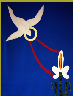
Advent Banner displayed in Narthex. Designed by

Monetary donations to the Food Pantry Fund are always welcome.