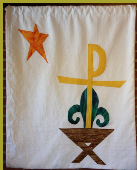
Christmas Banner displayed in Narthex. Created by

One of the requirements for participating in THRIVE is that each congregation must take the Church Assessment Tool (CAT). The results from the CAT provides the Thrive team, and other leaders of the congregation, with important information to help discern the future direction of the parish. To make the CAT survey as relevant as possible, WE NEED YOUR HELP!!! The more people who take the assessment the more accurate a picture it will provide. The survey will go live on January 11th and be open until January 29th. A link will be included in each e-Sword during this time frame. If you need access to a computer or a paper copy please contact the Rev. Kevin Caruso or Nancy Holmes (847)-381-2323.