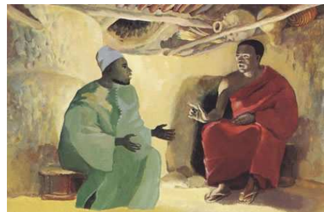
Artwork: "Jesus and Nicodemus",

Nicodemus (John 3:1-17) a learned clergyman who can't comprehend a metaphor. Then next week, the Samaritan woman at the well (John 4:5-42); then a