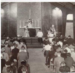
St. Michael's Church, circa 1954.

Original building with metal chairs for pews, altar attached to back wall, no tiles on floor, no stained glass windows, and all ladies wearing hats.