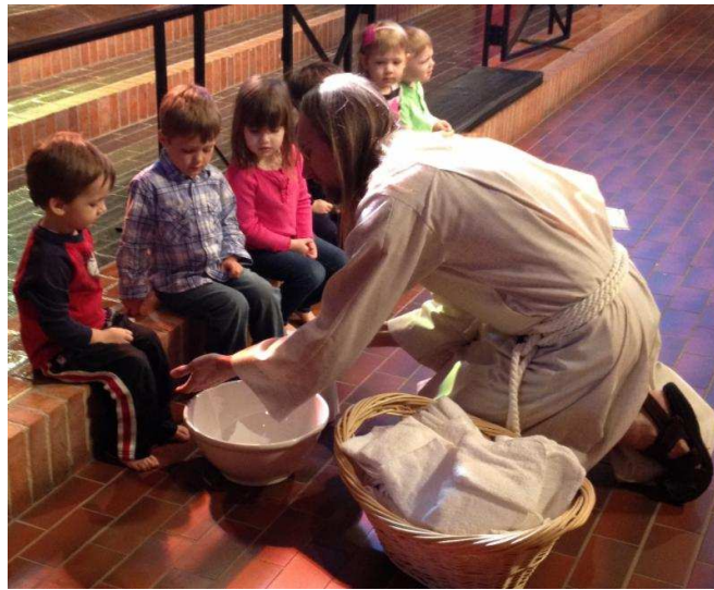
Jesus washing the feet of his followers

Join us for a very special tradition at St. Michael's as we Walk Through Holy Week . This service was prepared especially for families and will appeal to all ages. We'll follow the sacred story of Jesus as he enters Jerusalem, shares a last supper with his disciples and is, ultimately, glorified through resurrection.