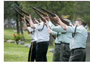
Gun salute at Evergreen Cemetery, Barrington

Join our local veterans in downtown Barrington on this special day to commemorate men and women who died while in military service to our country. For additional information contact waynetegeder@yahoo.com or 847-842-919.