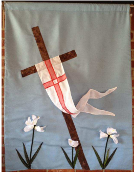
Easter Banner displayed in narthex