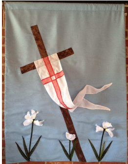
Easter Banner displayed in narthex