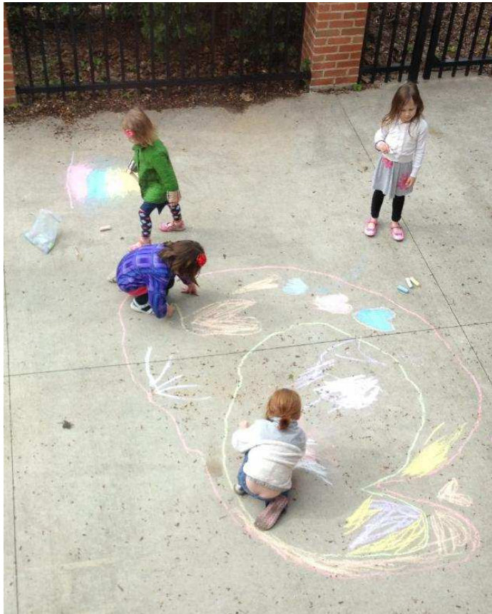
Playground Artists, May 14, 2014