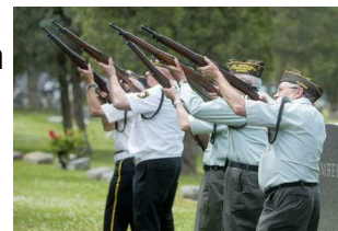
Gun salute at Evergreen Cemetery, Barrington