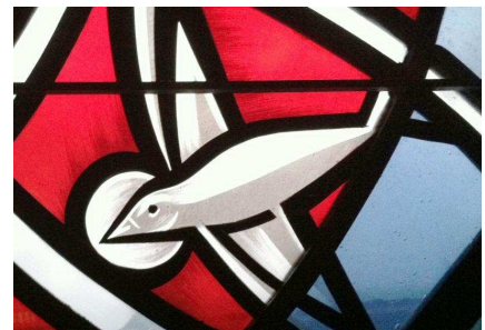
'Five of the windows in the St. Michael's nave include doves.

To find an answer, it's not necessary to know Greek or for a dove or flame to have alighted on your head. Just wonder about the most genuine point of contact between God and the real circumstances, relationships, challenges