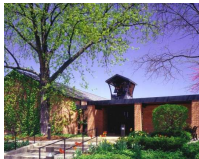
St. Michael's Website