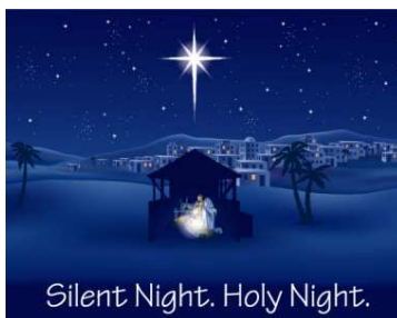
Silent Night. Holy Night.

Even more than other; And, if you have no house tonight, God bless you, brother.