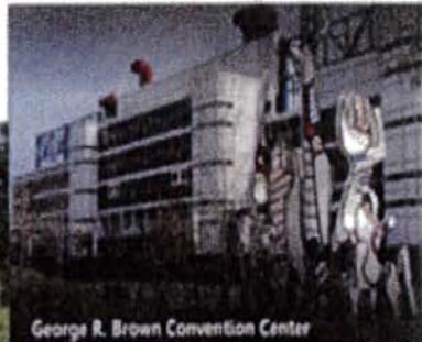
George R. Brown Convention Center