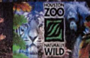
HOUSTON ZOO NATURALLY WILD