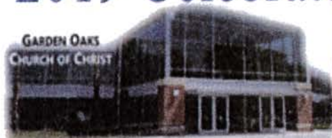
GARDEN OAKS CHURCH OF CHRIST