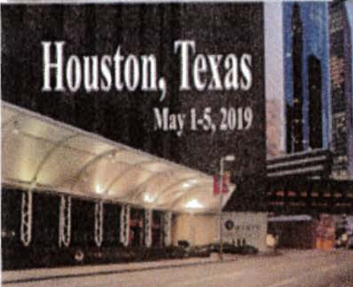
Houston, Texas May 1-5, 2019