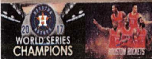
2017 WORLD SERIES CHAMPIONS