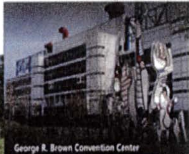
George R. Brown Convention Center