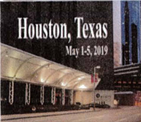
Houston, Texas May 1-5, 2019