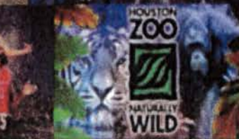
HOUSTON ZOO NATURALLY WILD