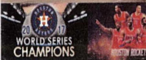
2017 WORLD SERIES CHAMPIONS