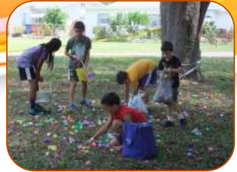
Hunting for Eggs