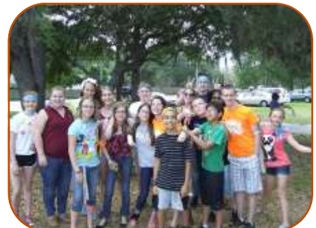
Our Youth Volunteers

Visit our facebook for more pictures of this and other events: http://www.facebook.com/StPaulUMCLargo