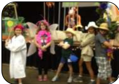
Our worship leaders

During Vacation Bible School we strive to give children the opportunity to discover their gifts to serve God and their community. This year, several of the children shared their gifts by leading our worship time with skits and music.