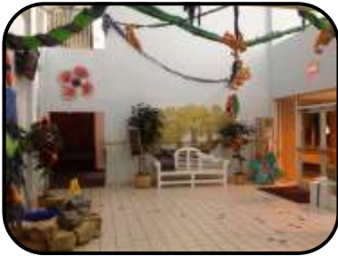
Welcome to the jungle!