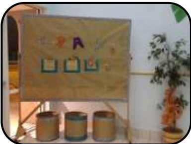
Under the prayer board were barrels used to collect supplies for the Jubilee.

This year's VBS was filled with incredible Bible-learning experiences where kids saw, heard, touched, and even tasted their lessons! Fun team-building games, cool Bible songs, and tasty treats were just a few of the activities that connected stories of faith to real life. The kids also discovered how to see evidence of God's one-of-a-kind love for us all and share this love with others through our Kid-to-Kid mission project. Each day the kids brought in items for the Back to School Jubilee the St. Paul Open Arms Resource Center.