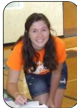
Just a few of our many volunteers.

Visit Facebook for more pictures StPaulUMCLargo