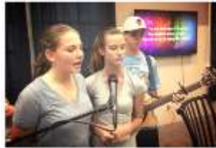
Teens leading worship.