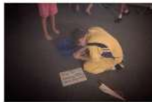
At a prayer station.

Our Worship Arts Class on Wednesdays at 6:30 p.m. is continuing to be a blessing for youth and children. Last week our teens led worship for the little ones before heading off to their own music lessons. The little ones learned about worship through prayer stations. Your teens and kids are always welcome to join us Wednesday nights from 6:30-7:30 in the worship arts room next to the sanctuary.