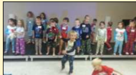
Some of the kids from last year having a great time.

There is no cost. Childcare and all the fun activities are free! Parents, this is a great chance to take an evening to yourself, while your kids have fun at the movies with us! Know a parent who would love a night off? Let them know about this event. It's free and open to the public!