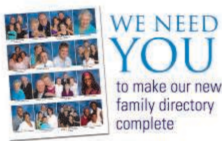
Photo Directory Final Days

The Suncoast Singers of Florida shared a wonderful patriotic musical program with us last Sunday, Jan. 10. About 125 people attended in the LuAnne Willey Fellowship Hall. Thanks to the Suncoast Singers for blessing us with this free program! All proceeds of the love offering taken at the concert support the ministries of St. Paul.