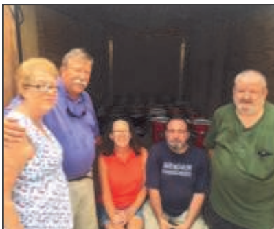
Some of our volunteers delivering the buckets to Hyde Park UMC