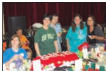
Handicapable Ministry at their booth