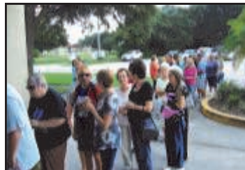
Line to enter the show.

Check page 9 for more on our volunteers, or visit our Facebook for more pictures of the event: StPaulUMCLargo