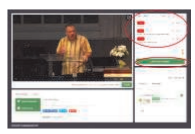
Use box on top right to chat.

Do you have an event or person you would like to honor with flowers? You can give a flower bouquet to the Glory of God. Call the church office at 584-8165, visit the Giving page on our website, or e-mail church@stpaulumc.org. Bouquets are $40. Be sure to include your inscription with your order. Flowers can be donated to hospitals and the homebound, or picked up after 10:30 a.m. worship on Sunday or at the church office during the week.