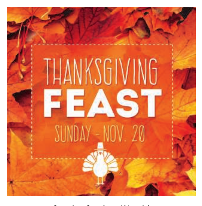
Sunday Student Worship Bring a dish to share tonight and join us at 5:30 p.m. for a potluck Thanksgiving Feast!