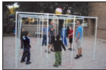
Students helped lead games

On Saturday, December 3, St. Paul hosted more than 75 kids for our annual Parents Night Out. We had a great night of fellowship and fun and took our Strategic Initiative to heart by reaching out to local families. The kids played games like "Sharks and Nemo" and "Nine Square In The Air," ate dinner, and made cat toys to donate to local animal shelters, a service project chosen by the kids in our Wednesday Worship Arts Class. Our message taught kids that we can find God by following the path he has left for us. Like Dory, we should "just keep swimming" toward Jesus! Thank you to our volunteers and everyone who helped out to make this night run smoothly.