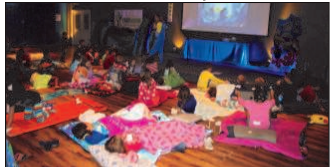
Watching the Finding Dory movie together