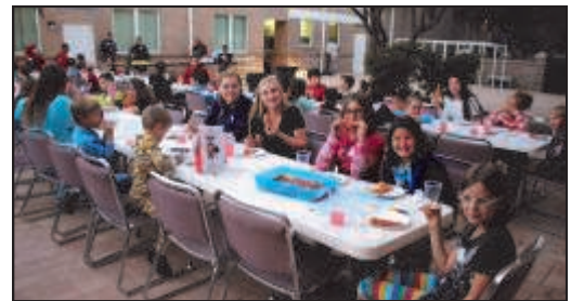
Dinner in the courtyard