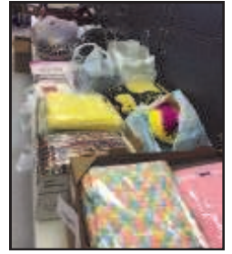
Over 160 items were received!

Five weeks ago our Prayer Shawl and Stephen Ministries asked for help in providing 120 prayer shawls for Highland Pines Nursing Home. We were overwhelmed by the response! Shawls, blankets, lap robes, caps, even stuffed animals came in from so many different people, we ended up with over 160 items! The overflow will be given to the Open Arms Ministry and distributed through the Christmas toy giveaway. Thank you to all our knitters and crocheters for letting God use you to bless so many people!