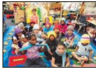
Kids at Ponce de Leon wearing hats and scarves made by Prayer Shawl Ministry

Prayer Shawl Gives in Love to Kids & Homeless In addition to prayer shawls, our Prayer Shawl Ministry also made and distributed 90 caps and scarves for the children at Ponce de Leon elementary school. Caps were also given to the homeless at our homeless feedings and at The Refuge. We're so grateful to everyone who takes part in this ministry!