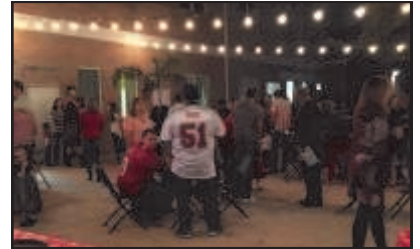
Families sharing snacks in the courtyard.