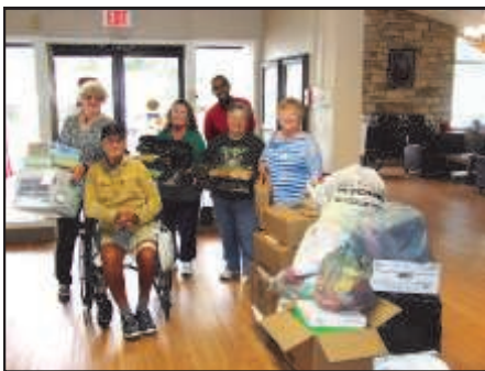
Delivering gifts for the residents

Visit our Facebook for more pictures: StPaulUMCLargo