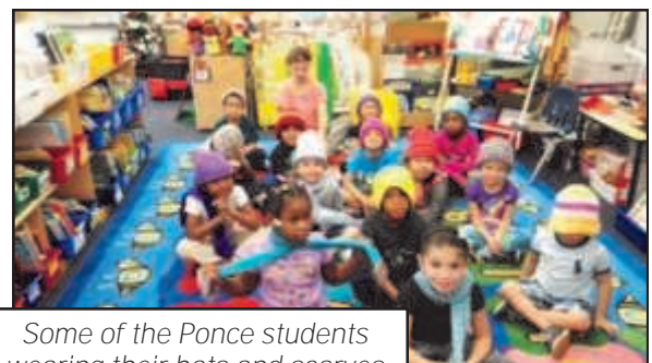
Some of the Ponce students wearing their hats and scarves