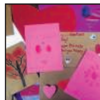
Cards from Ponce DeLeon