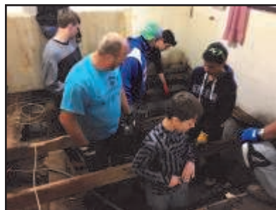
Working on building a new deck, interior painting and more