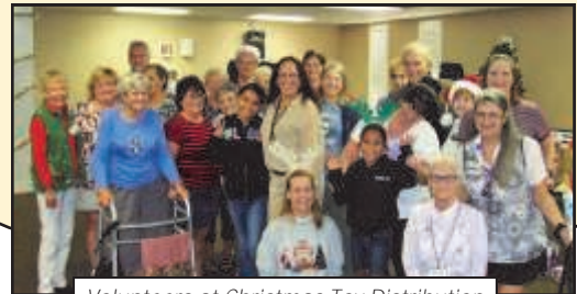
Volunteers at Christmas Toy Distribution

Volunteer to help sort, fold, stack and package donations. Volunteers are also needed to pick up food deliveries, and to help take donations. Let us know on the Connect Card in this bulletin or e-mail church@stpaulumc.org if you'd like to help.