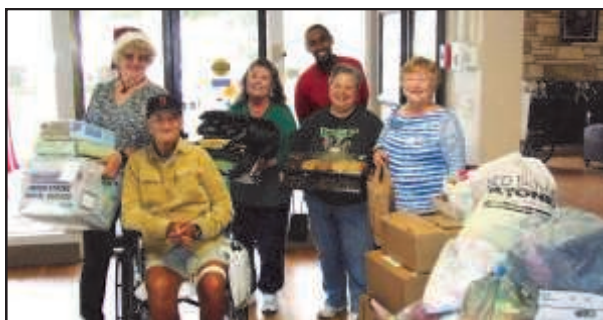
Stephen Ministry and Prayer Shawl Ministry delivering prayer shawls, hats and more to Highland Pines Nursing Home

Discover St. Paul Lunch May 7 at Noon | LuAnne Willey Fellowship Hall Are you new to St. Paul? Thinking about becoming a member or just want to know more about us? Join us for this informal lunch to find out more about who we are as a church, our mission, and core values. We'll show you around and introduce you to some of our staff and other new people. Want to join us? Email church@stpaulumc.org , call 584-8165, or fill out the Connect Card on page 4.