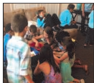
Kids decorating bags for their Easter egg hunt