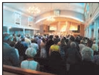
9 a.m. Worship