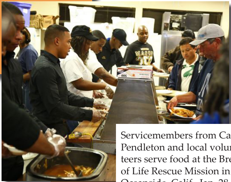
Servicemembers from Camp Pendleton and local volunteers serve food at the Bread of Life Rescue Mission in Oceanside, Calif., Jan. 28. Nine Marines and one sailor, with the help of several community volunteers, prepared and served a free dinner for local homeless and others in need at the Mission. http://www.1stmlg.marines.mil

If you'd like more information on serving with Bread of Life, call the Church Office.