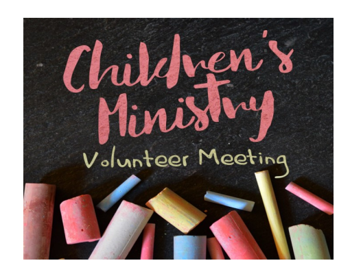
Kids Kove Volunteer Meeting

9:30am Middle School [sc] High School [office]